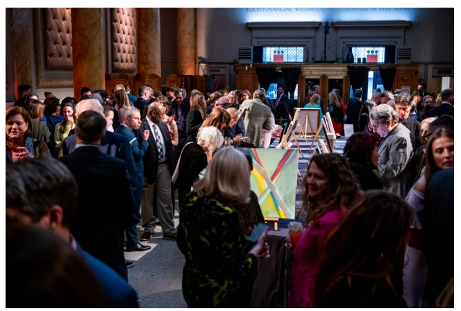
Image: Guests enjoying the art auction during cocktail hour at NYFA's 2023 Hall of Fame Benefit