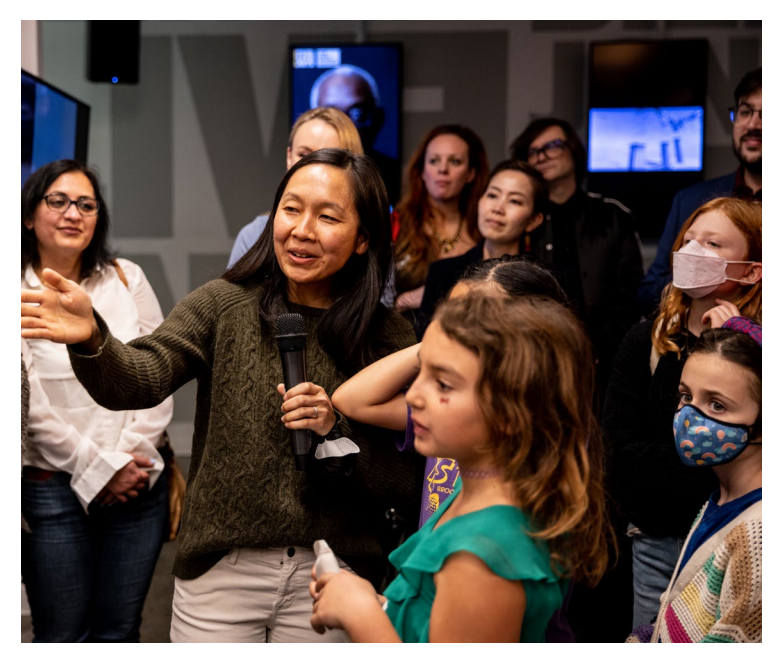
Image: "In/Between 2023: Lush Friction,"

During the past fiscal year. NYFA Learning has directly served 2,785 artists and cultural workers—through both in-person and online professional development programs and workshops. An additional 650+ were provided with access to workshop materials and 9,300+ subscribed to our newsletter. NYFA Learning's core goals are to build and foster creative communities through education, offered locally, nationwide, and internationally. We offer tools and resources that artists and cultural workers can apply to their career and/or artistic practice.